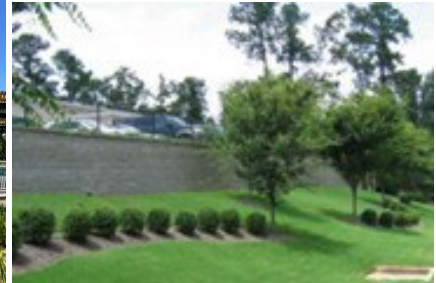
Parking screening concept imagery