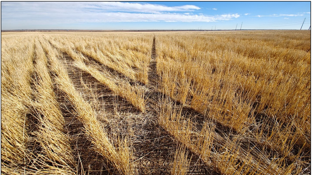
4. From center of proposed pad facing east.