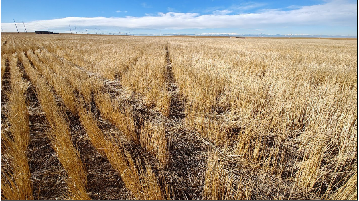
3. From center of proposed pad facing west.