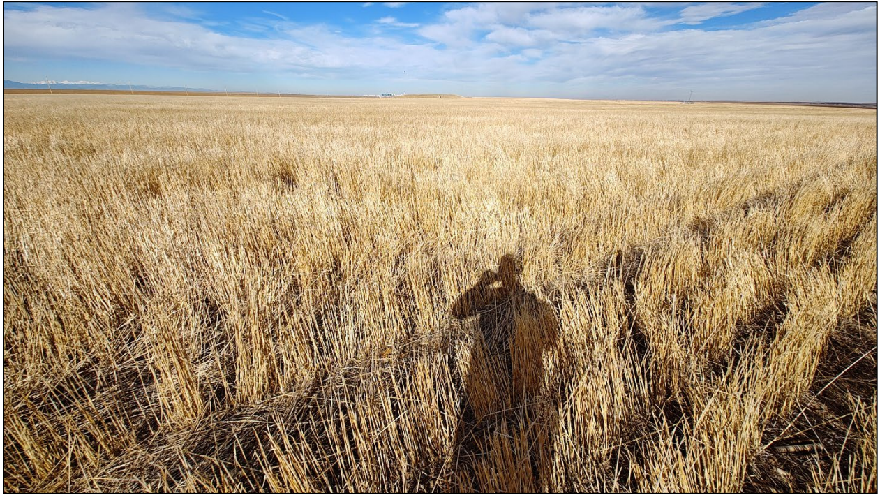
1. From center of proposed pad facing north.