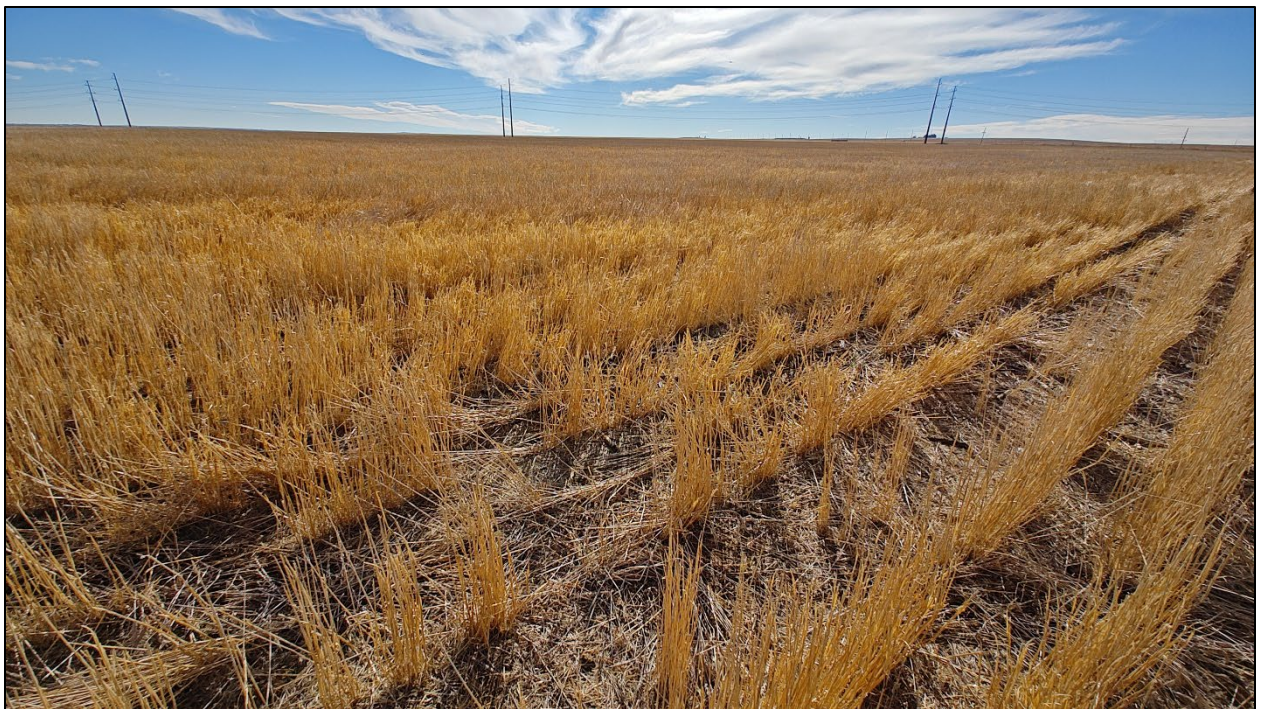
2. From center of proposed pad facing south.