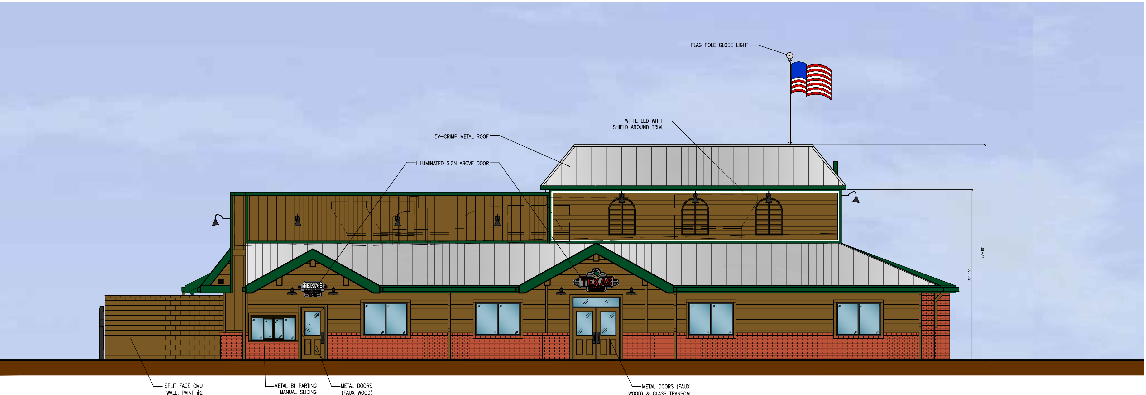
LEFT ELEVATION (NORTH)