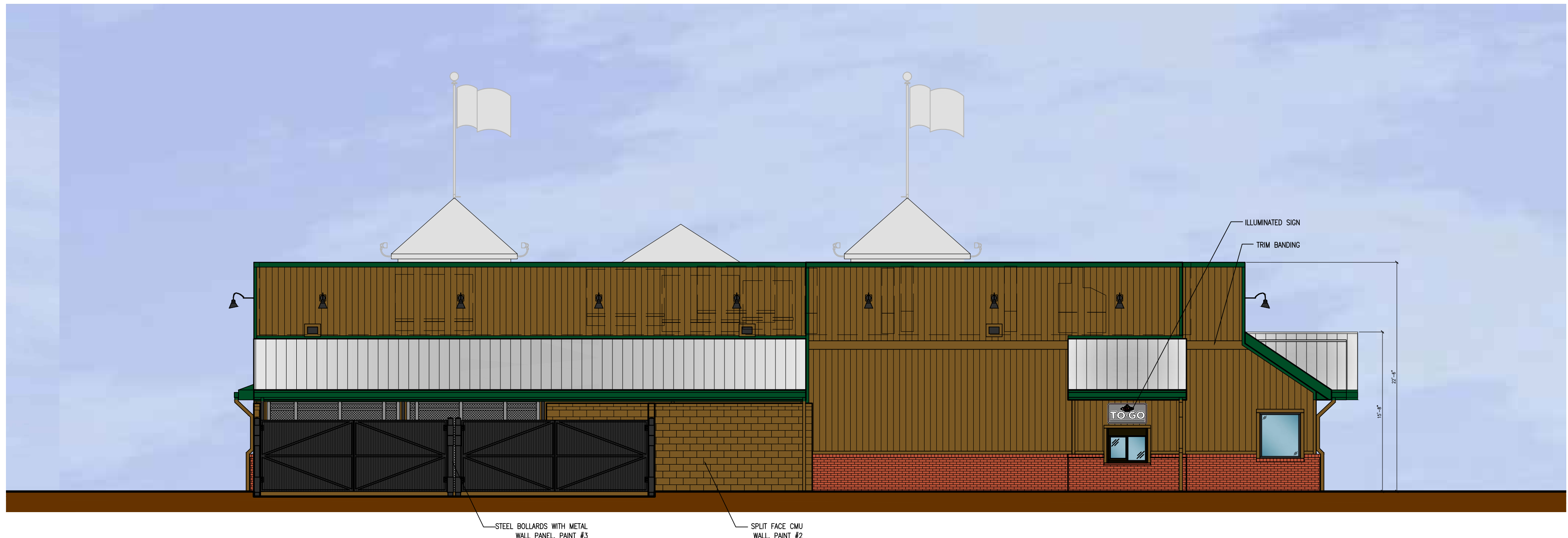
REAR ELEVATION (EAST)