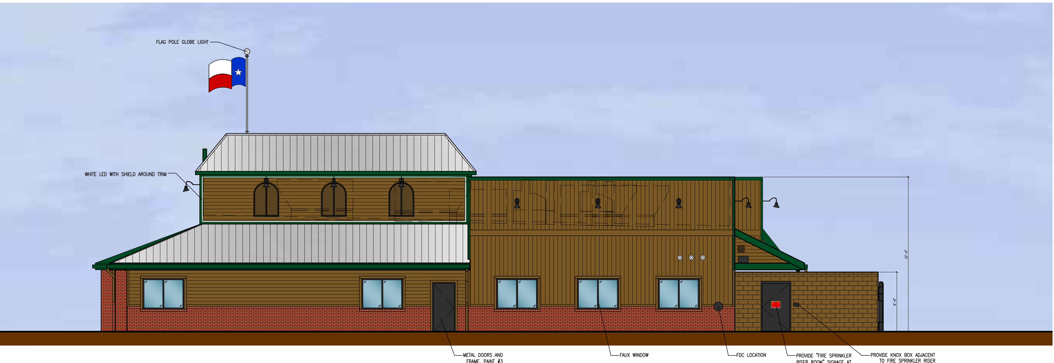
RIGHT ELEVATION (SOUTH)

Provide address: (a) Definition. As used in this section, the term "approved numbers" shall mean Arabic numerals, of uniform height, made of some durable material which are sharply contrasted to the color of the material on which they are placed and are of a size capable of being distinctly readable from the street, but in no case less than four inches in height. (b) Placing. Approved numbers shall be placed on each building or structure at such location thereon which is nearest to the street or road fronting the property, and in such a position as to be plainly visible and distinctly legible from the street or road. Approved numbers shall also be placed in such a position as to be plainly visible and distinctly readable from a fire lane at the rear of the building or structure when, for emergency purposes, access thereto is also from a fire lane. To the extent possible, approved numbers shall be located adjacent to light fixtures or other light source. (Code 1979, § 34-129)