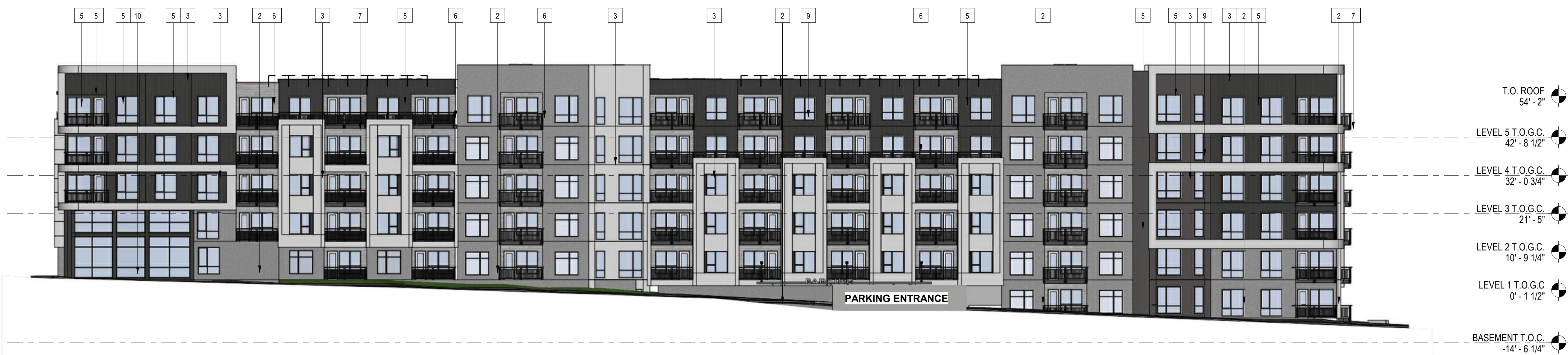
BUILDING A - SOUTH ELEVATION