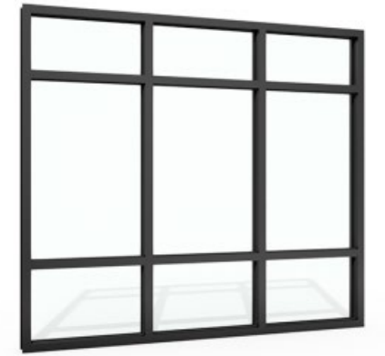
11 STOREFRONT DARK BRONZE