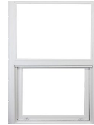
10 VINYL WINDOWS - WHITE