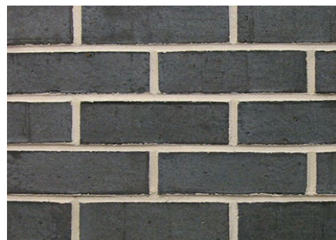
2 ACCENT BRICK - MODULAR BLACK DIAMOND - WIRE CUT