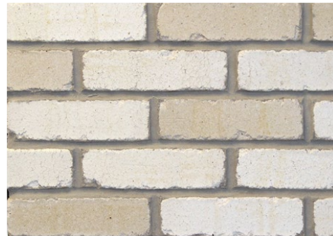
FIELD BRICK - MODULAR NEPAL