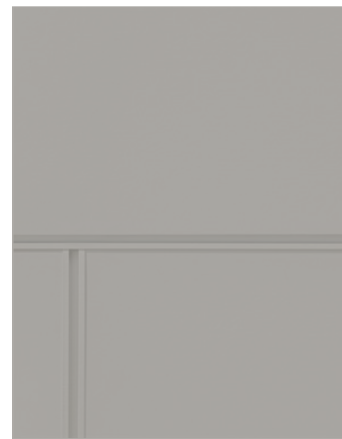
4 FIBER CEMENT PANEL - WITH REVEALS SW7673 - PEWTER CAST