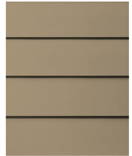
6 FIBER CEMENT LAP SIDING - WITH REVEALS WOODTONE - MOUNTAIN CEDAR