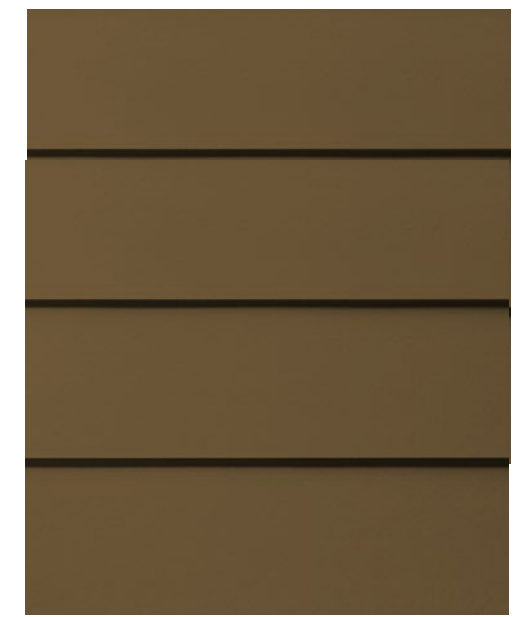
6 FIBER CEMENT LAP SIDING - WITH REVEALS WOODTONE -