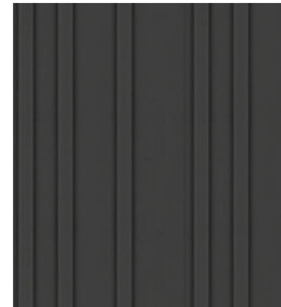
4 FIBER CEMENT PANEL - WITH REVEALS SW7069-IRON ORE