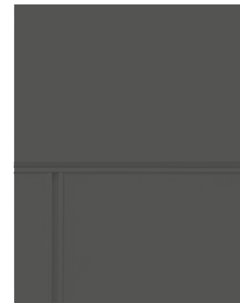
5 FIBER CEMENT PANEL - WITH REVEALS SW9610-STONY CREEK