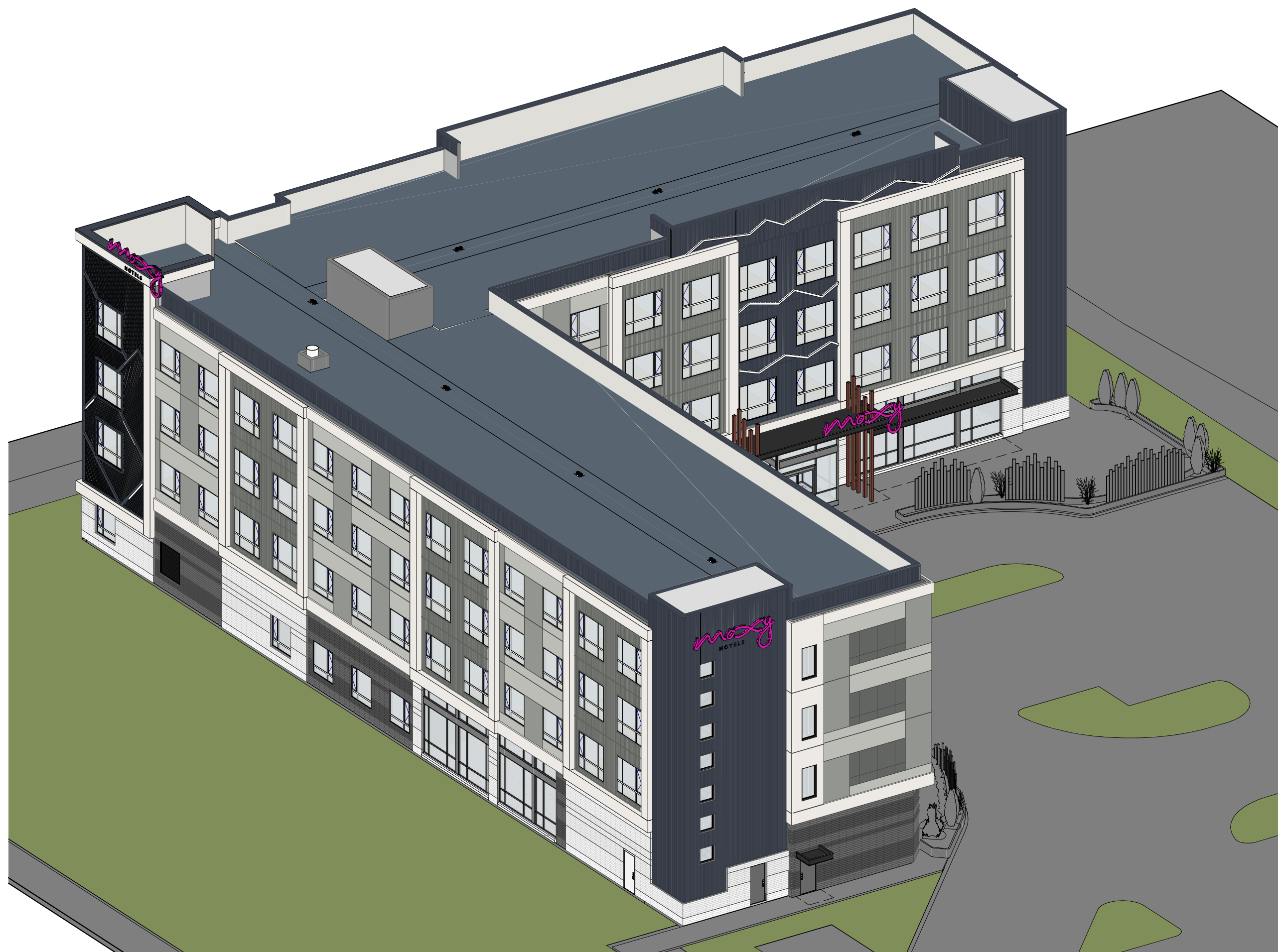
1 3D VIEW - NORTH-WEST CORNER A-4.3A SCALE: