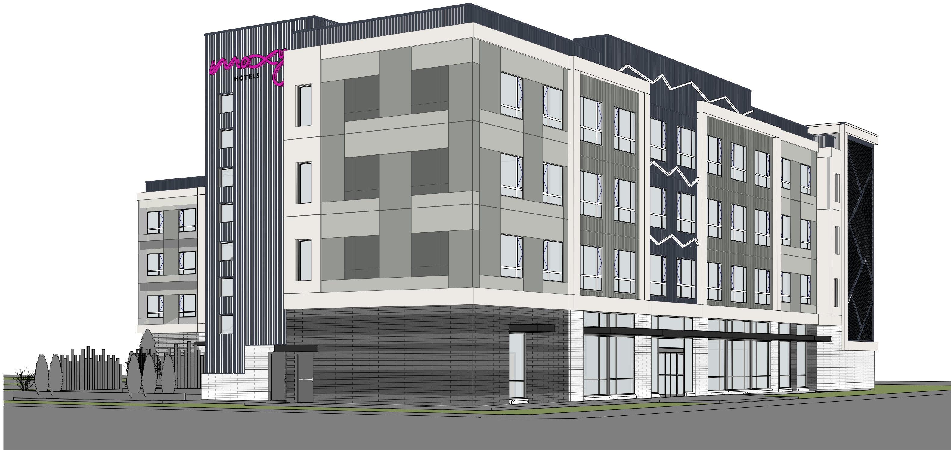
4 AXON VIEW - SOUTH-EAST CORNER A-4.3A SCALE: