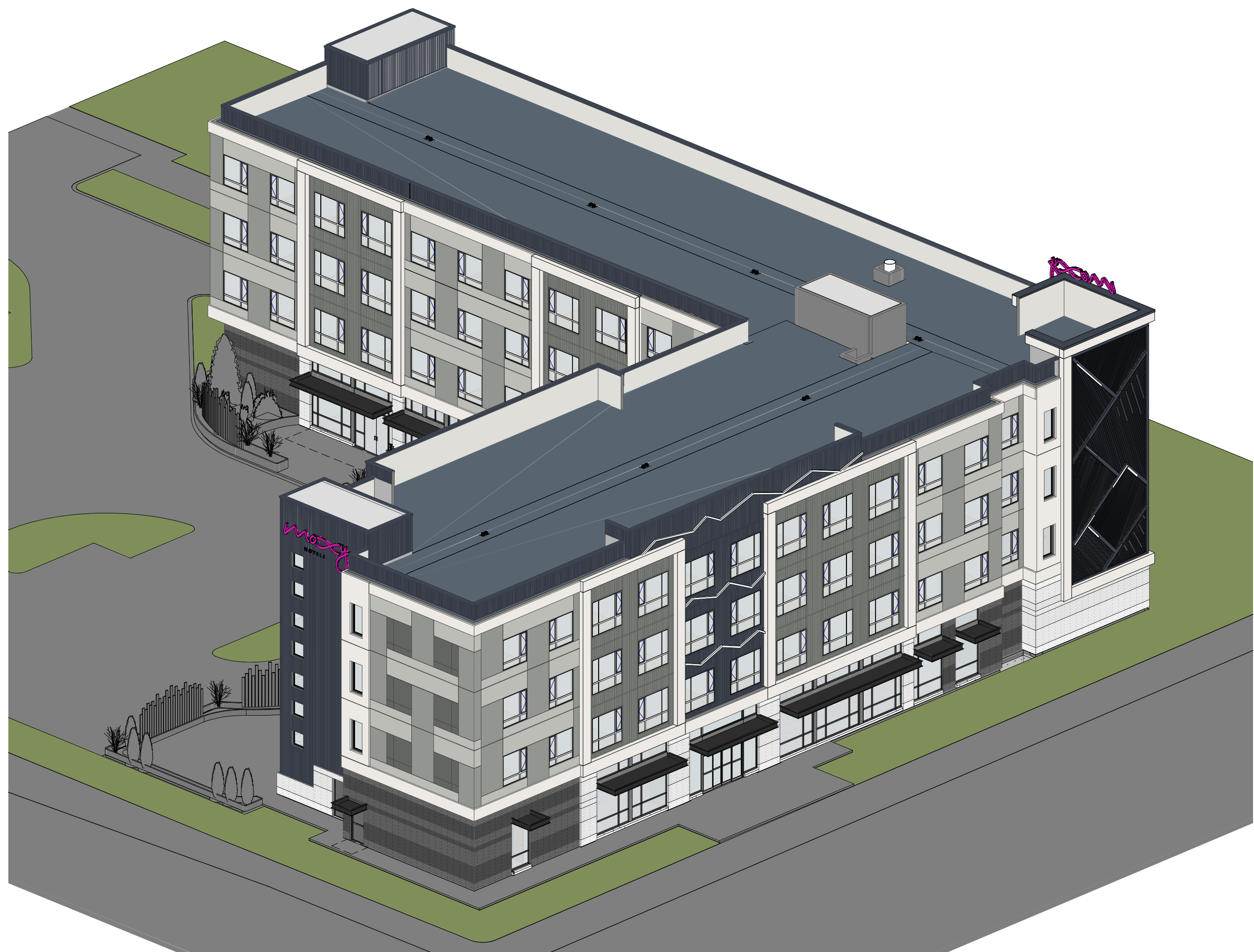
2 3D VIEW - SOUTH-EAST CORNER A-4.3A SCALE: