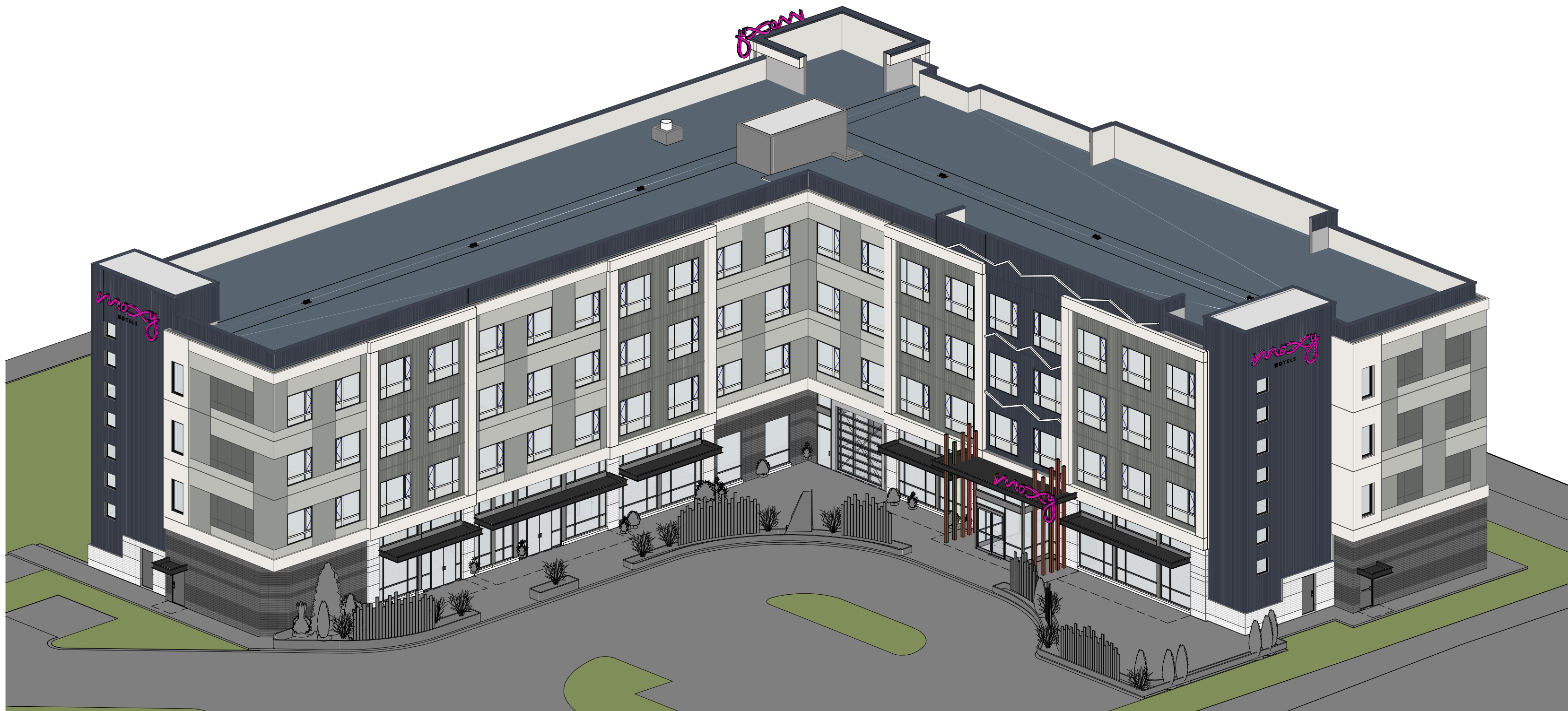
1 3D VIEW - SOUTH-WEST CORNER A-4.3 SCALE: