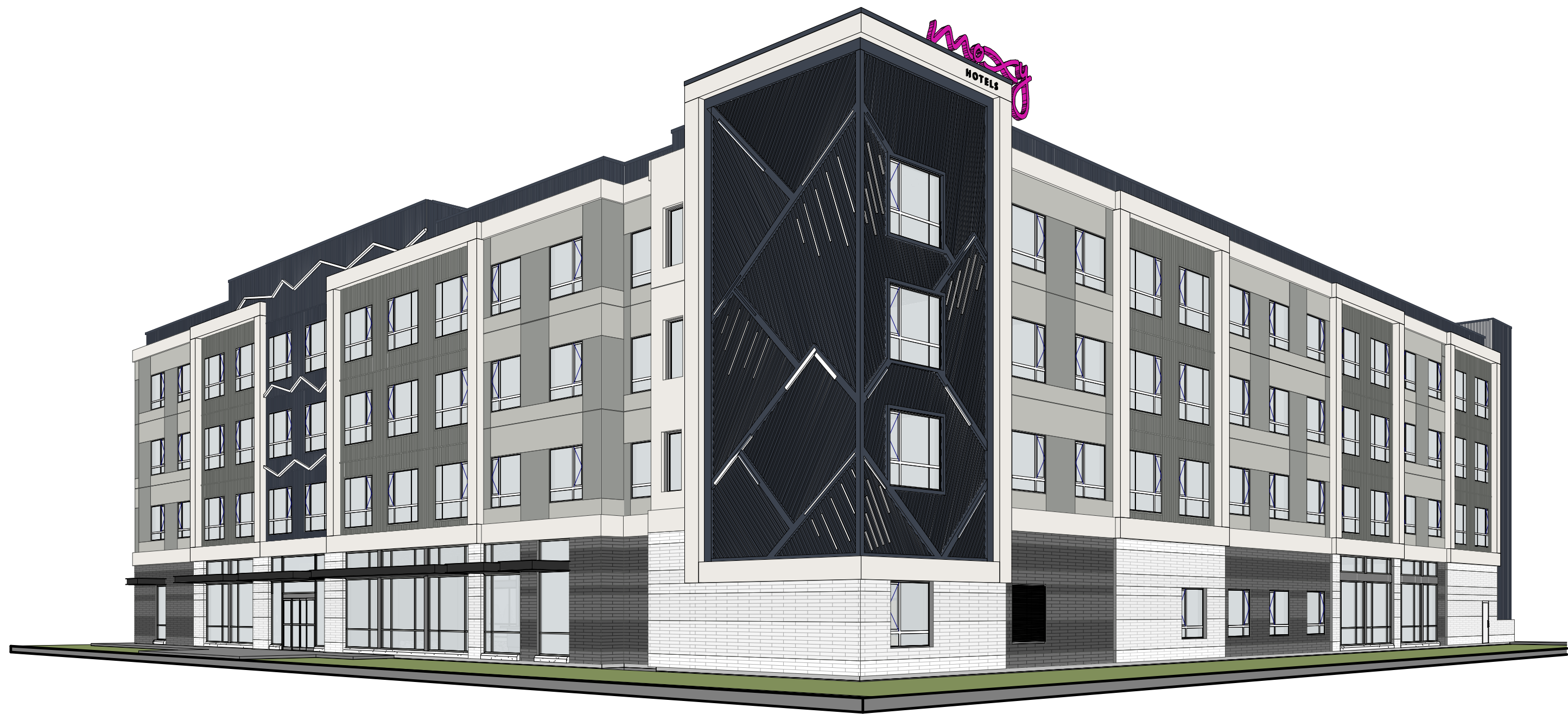
4 AXON VIEW - NORTH-EAST CORNER A-4.3 SCALE: