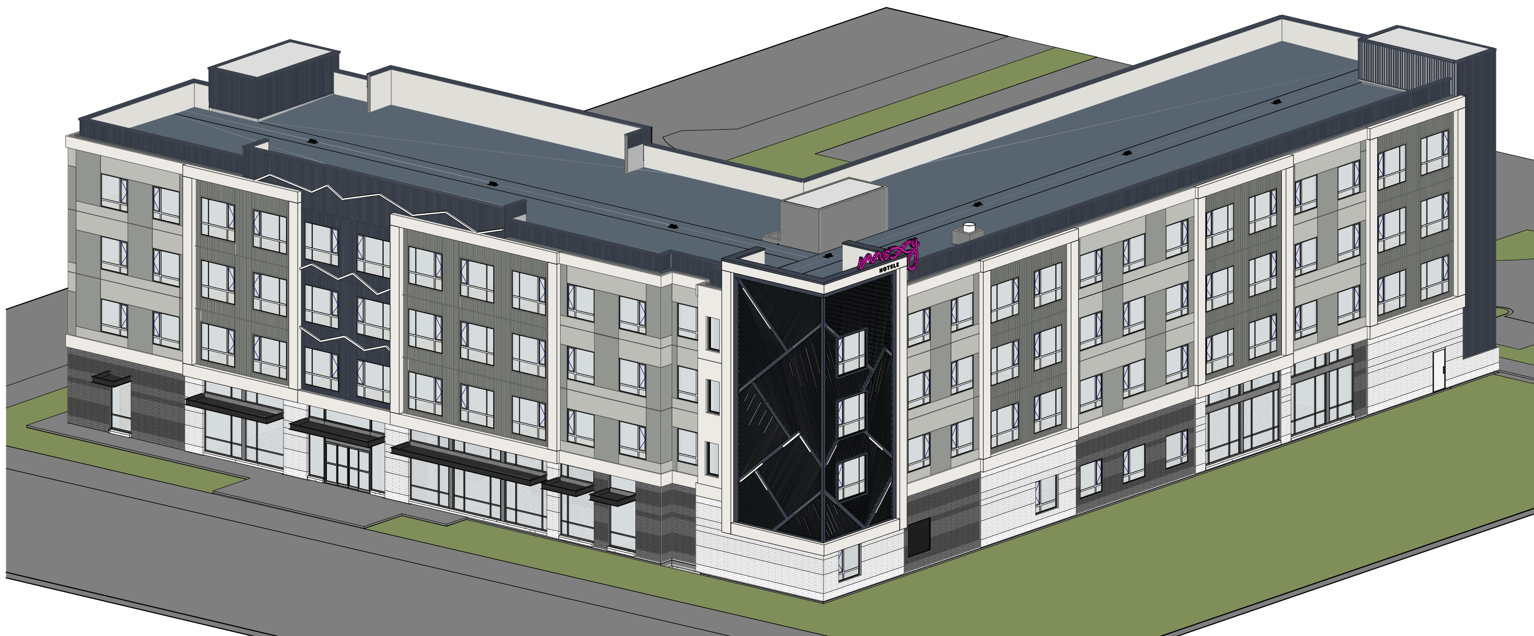
2 3D VIEW - NORTH-EAST CORNER A-4.3 SCALE: