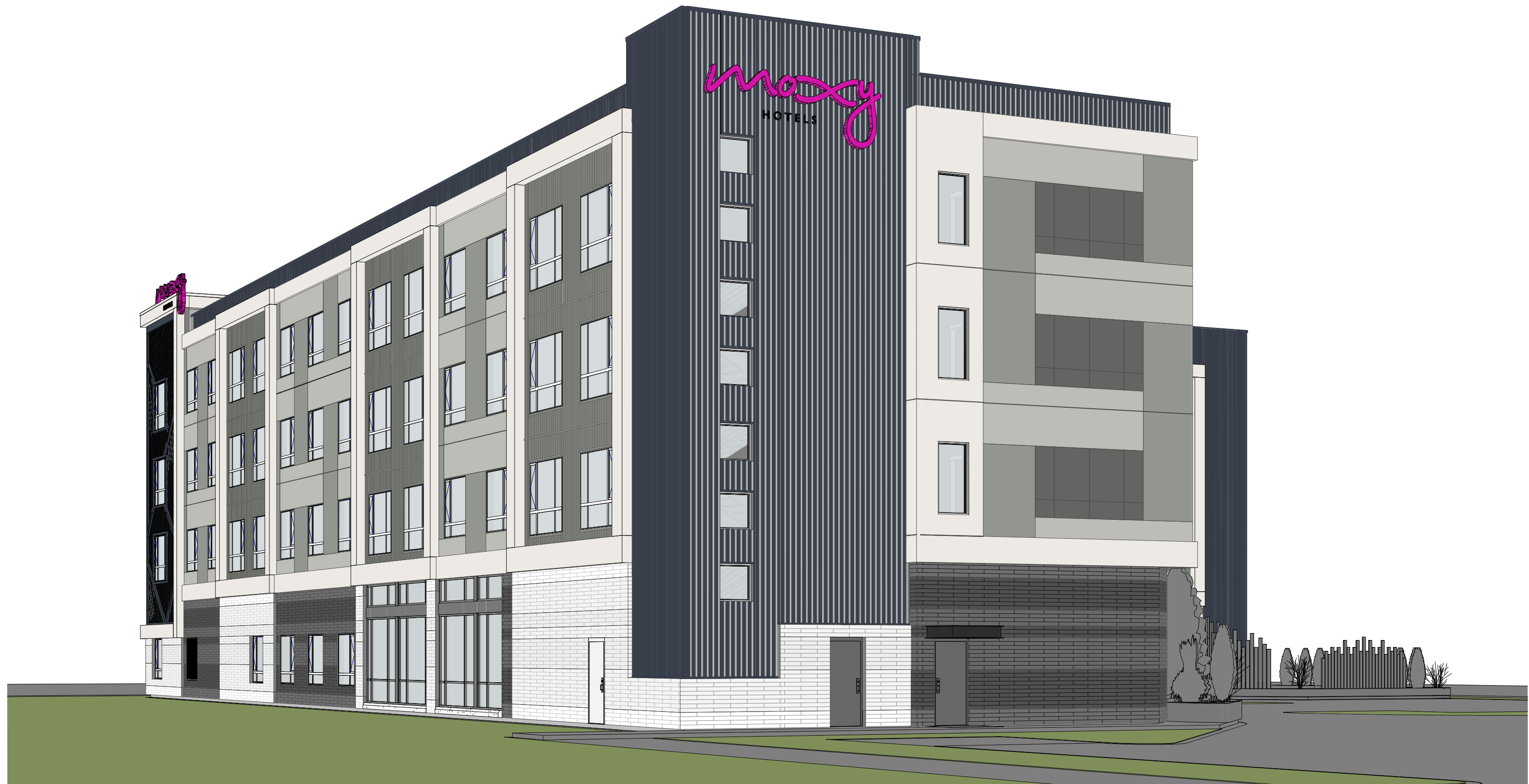
3 AXON VIEW - NORTH-WEST CORNER A-4.3A SCALE: