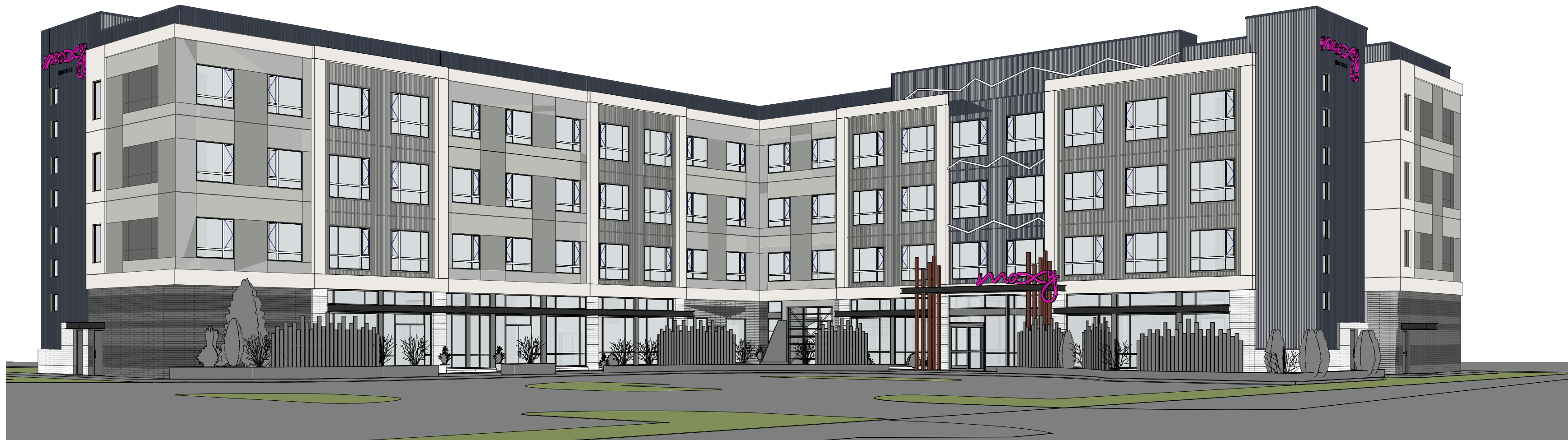
3 AXON VIEW - SOUTH-WEST CORNER A-4.3 SCALE: