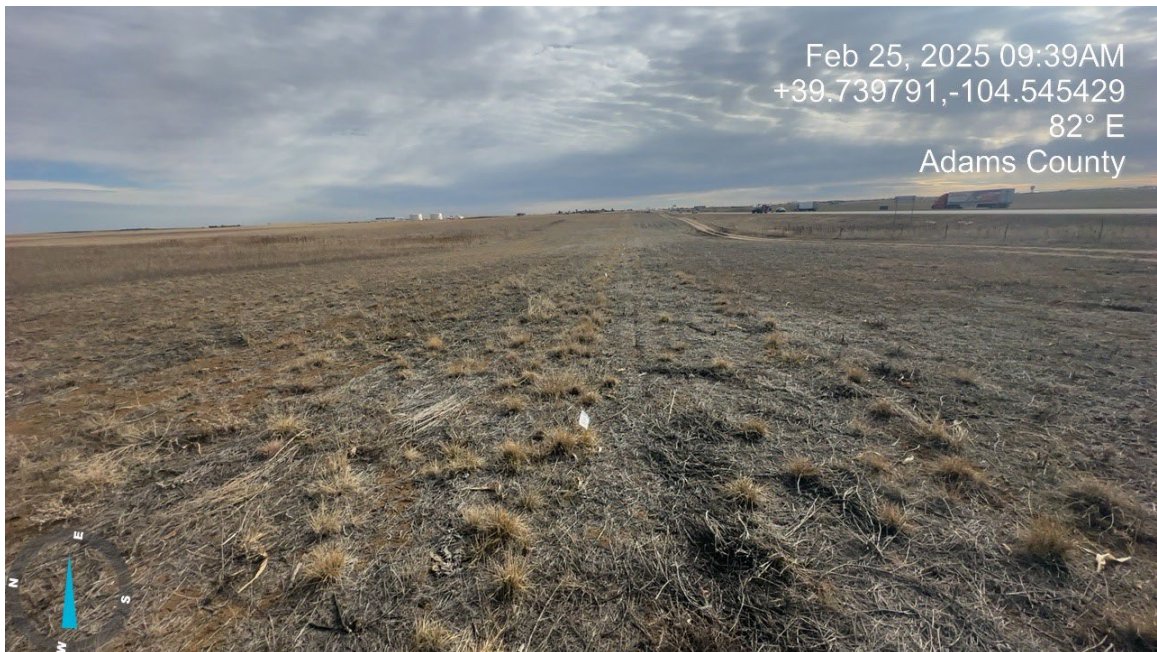
2. Near the southwestern corner of the lateral facing east along the ROW.