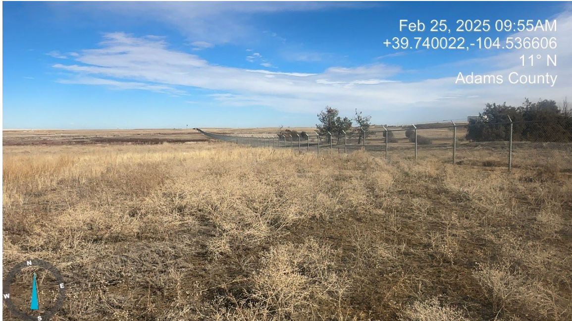
4. Near the southeast corner of the lateral facing north along the ROW.