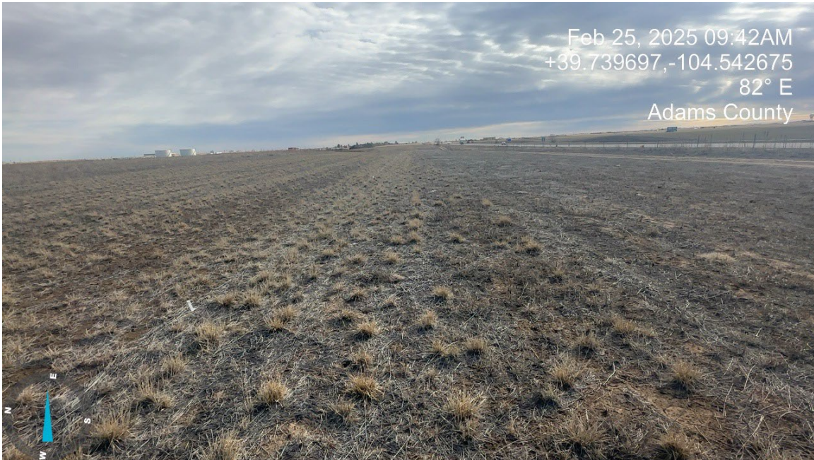
3. Near the center of the lateral facing east along the ROW