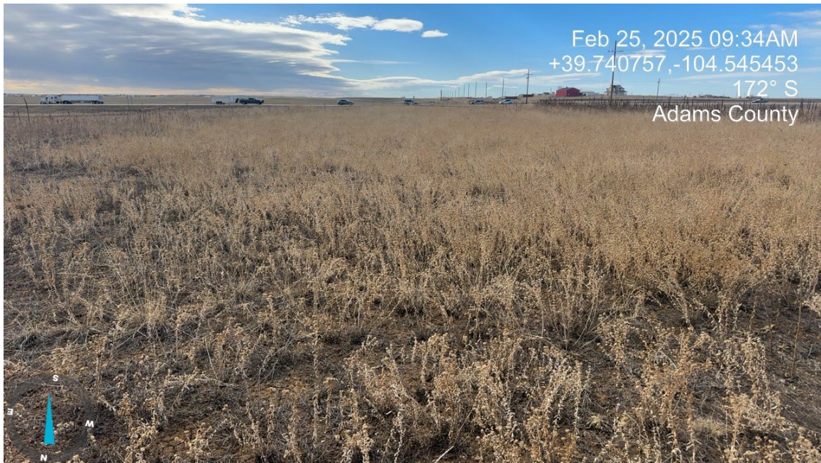
1. Near the western terminus of the lateral facing south along the ROW.