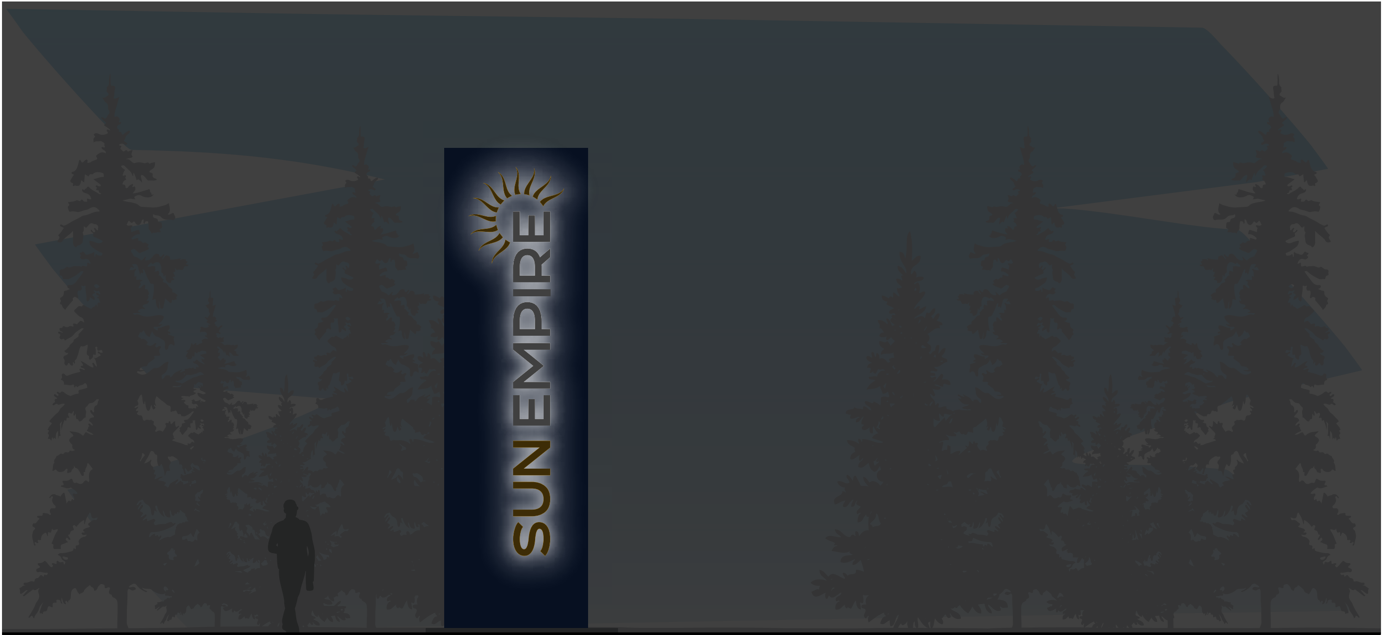
EX-A Pylon Monument - Illuminated View 1/4" = 1'-0" Qty: 1