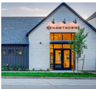
Brick or stone accents provide visual anchors for entrances and highlight architectural details.