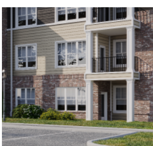
Brick or stone wainscoting provides a base that anchors the home to the ground.