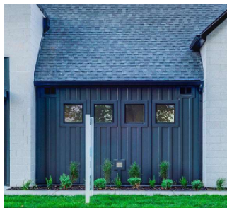
Board & batten siding helps to give the massing verticality and to simplify the building mass.