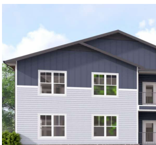
Low-pitched gable roof forms with large eave and rake overhangs to convey a strong Craftsman style image.