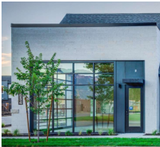
Large windows should be used. Mullions in grid patterns or reflective of a double hung window evoke the traditional style