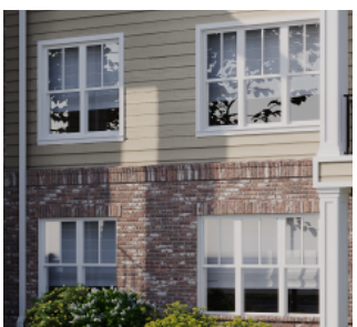
Grouped single or double- hung windows are vertical in orientation.