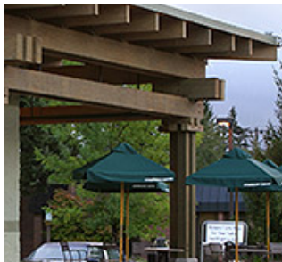
Decorative gables and exposed structure treatments provide a visual hierarchy and explicates the Farmhouse and Craftsman styles.