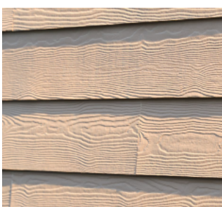
Horizontal siding references the typical cladding material for this style.