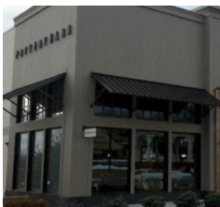
Covered awnings in a variety of materials provide aesthetic interest and function.