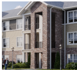
Traditional column helps evoke a sense of simple, which helps to emphasize building form.

Both the Craftsman and Farmhouse styles are functional, plain, and well proportioned without extensive use of embellishments. The Opal Master Plan, though influenced by the Craftsman and Farmhouse styles, may not present all character elements shown here. Images included represent character and mood of the Opal Master Plan, however specific design shall be determined at the time of future Site Plan application.