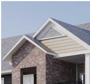
Decorative gable treatments provide a visual hierarchy that distinguishes the Craftsman and Farmhouse architecture from other styles.