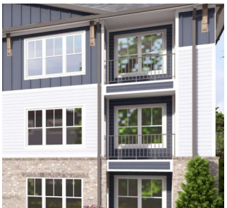
Covered porches and outdoor spaces provide a platform for outdoor socializing, entertainment, and leisure.