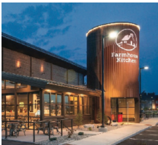
Enhanced architectural features such as covered porches, overhangs, windows, colors or materials provide a clear and welcoming entrance.