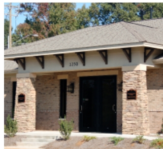
Traditional column helps evoke a sense of simple, which helps to emphasize building form.

Commercial architecture within the Opal Master Plan may vary based on tenet needs. Architectural style may reflect more contemporary elements than as seen in residential buildings, such as flat or shed roof forms, but should still nod to the overarching craftsman and farmhouse aesthetic. Below are images reflective Craftsman and Farmhouse character in commercial applications, however specific design shall be determined at the time of future Site Plan application.