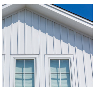
Board & batten siding helps to give the massing verticality and to simplify the building mass.