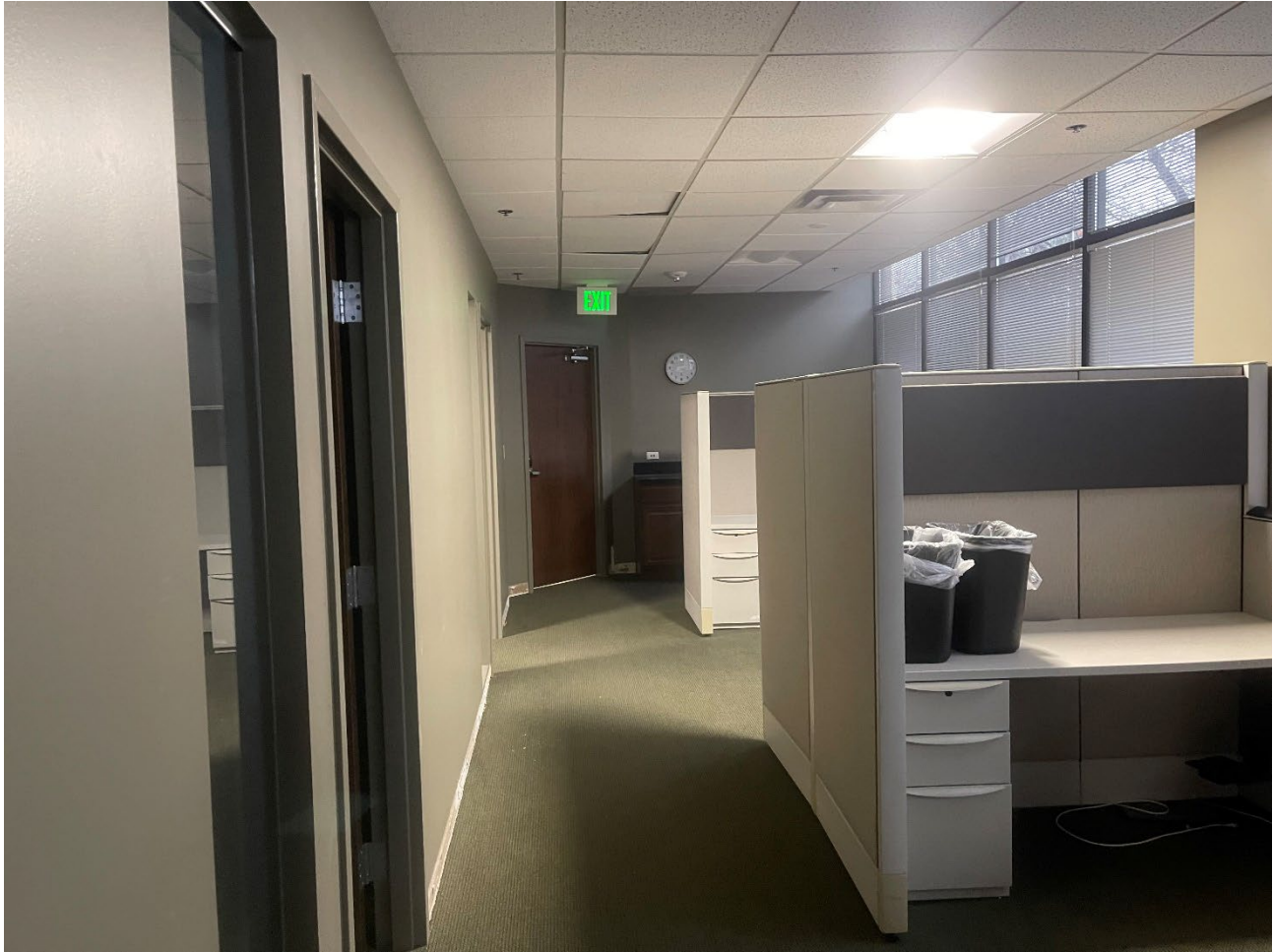
Figure 3. A second-floor office space with ceiling, wall, and floor damage. This layout is similar in nature to the other office spaces on the second and third floor with angled walls and inefficient space for potential office use.