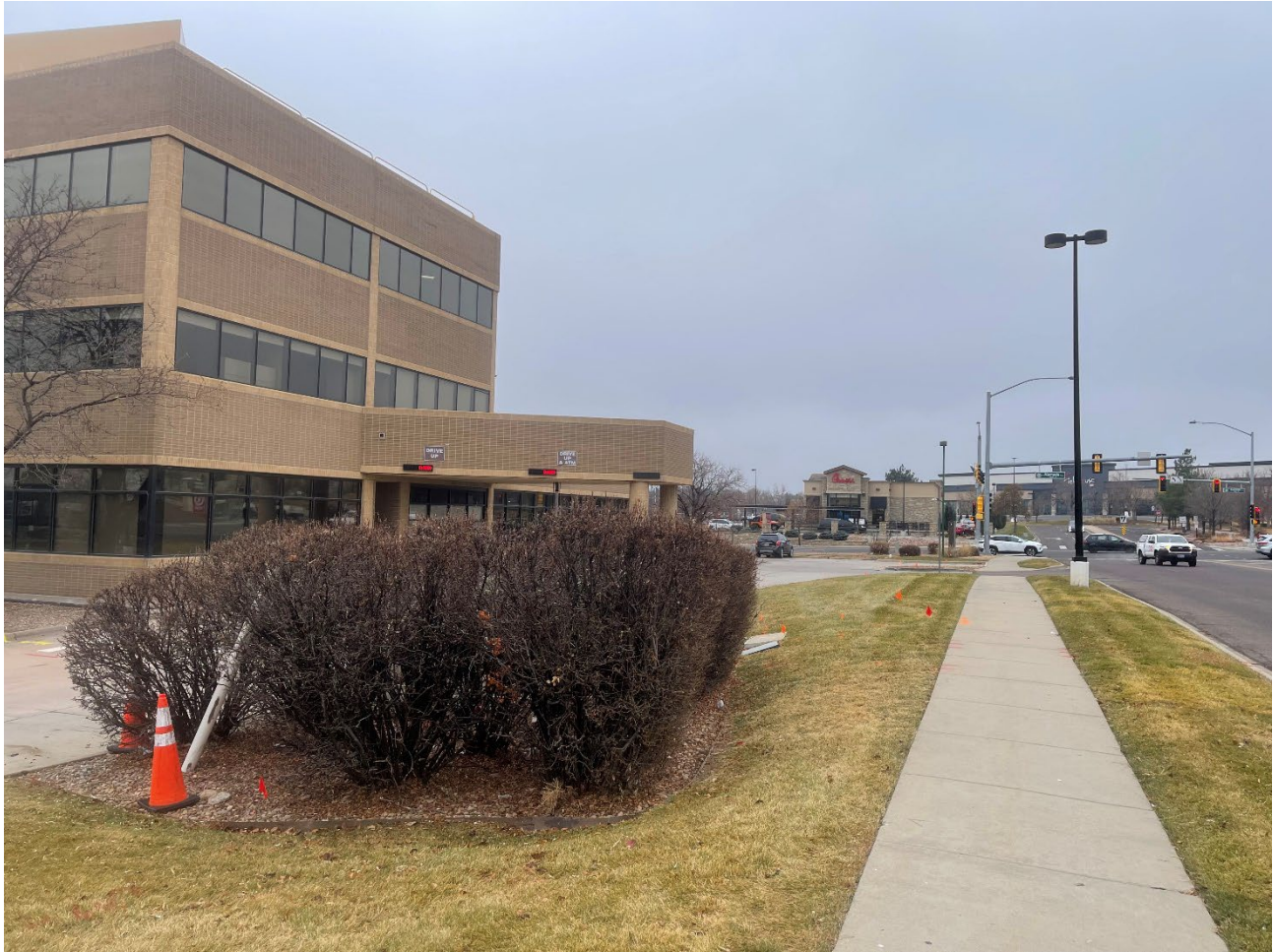
Figure 5. Looking south on South Crystal Street towards its intersection with East Alameda Avenue. The building is setback from the street corner and has no interaction with the street corner.