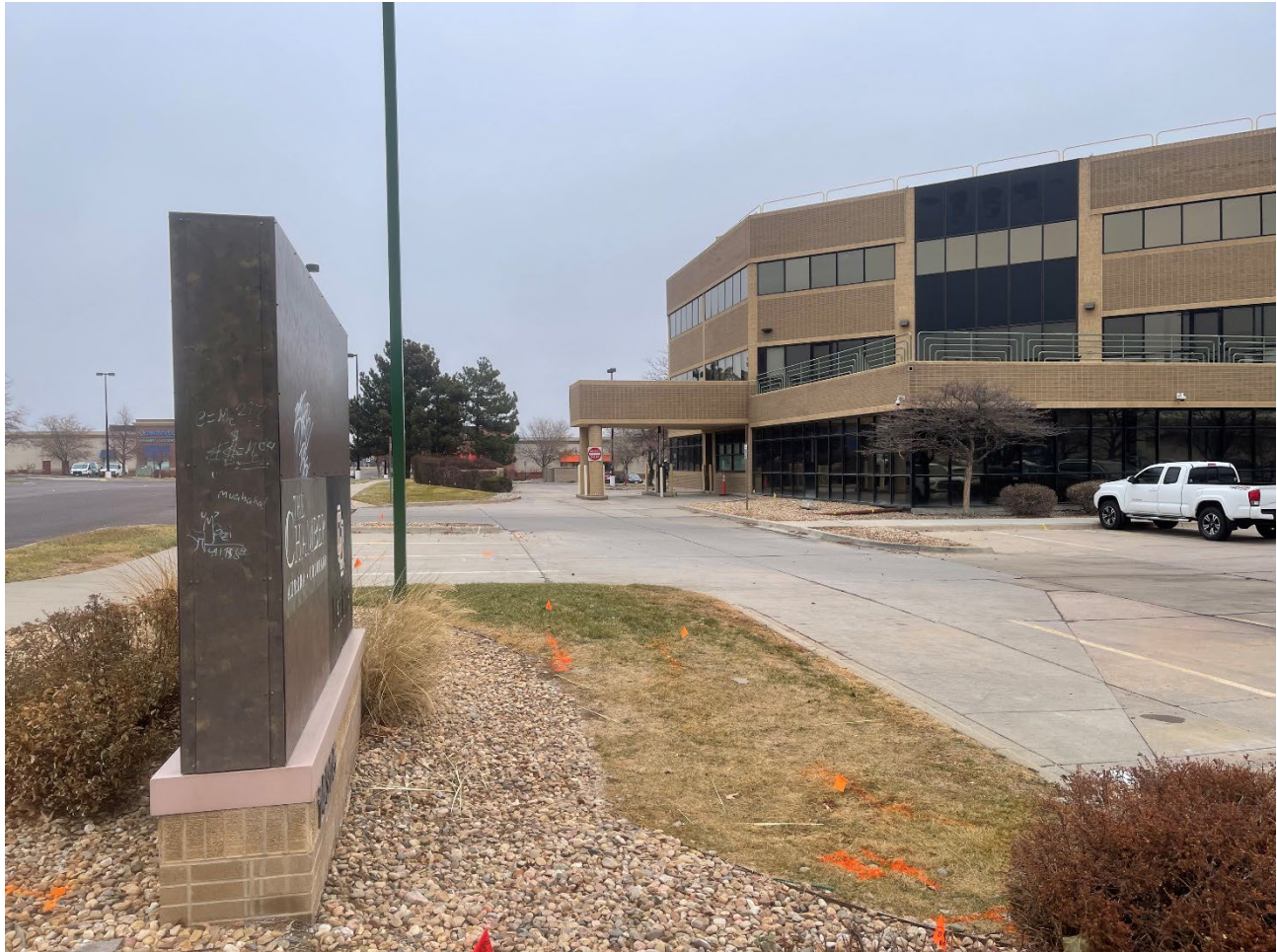
Figure 4. Looking north along South Crystal Street with East Alameda Avenue located behind the photo taker. This corner features a damaged and vacant monument sign, and the building presents an empty, unused bank to the corner.

repairs are prohibitive to the continued use of the property as an office building, encouraging rethinking the use of the site in a way that benefits the wider area. The lack of redevelopment on the site would continue to lead to vacancy issues and continued decline of the space in an area targeted for large-scale urban redevelopment. As seen in figure 4 and 5 below, the current building has no relationship to the corner of East Alameda Avenue and South Crystal Street and does not contribute any vibrancy or sense of place to the corner.