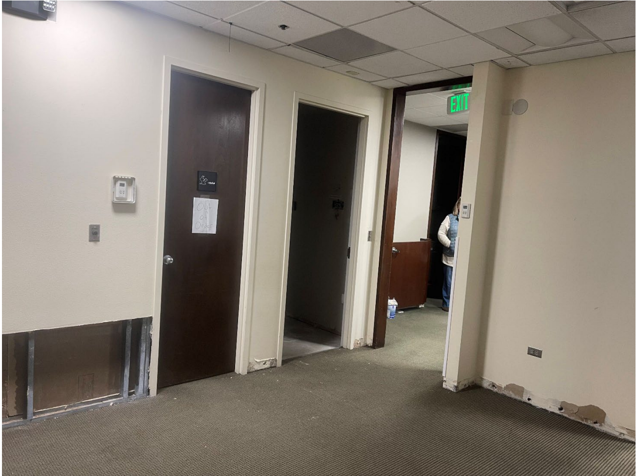
Figure 2. Taken from the basement, this photo show damage to the floors, walls, and ceilings. This basement space is connected to the 1 st floor bank space and was at one time used for the vault and storage.