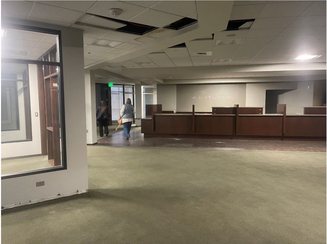
Figure 1. First floor former bank location with damaged ceilings, walls and floors. The layout of this space is continuous and does not feature any common space that would allow it to be broken up into smaller office spaces.