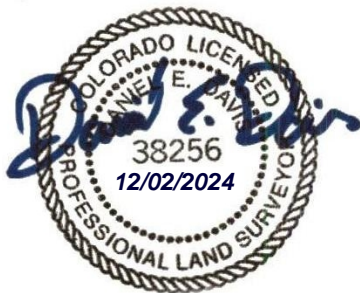
EXHIBIT ATTACHED AND MADE A PART HEREOF.