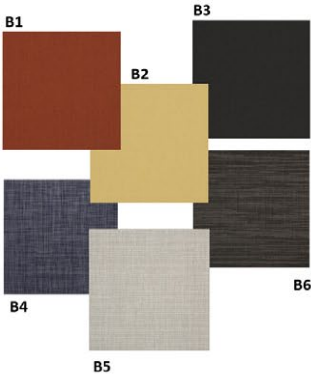
SHADES: B1 TRESCO CLAY B2 WHEAT B3 SLATE B4 SPA B5 ALLOY DUNE B6 ALLOY SILVER