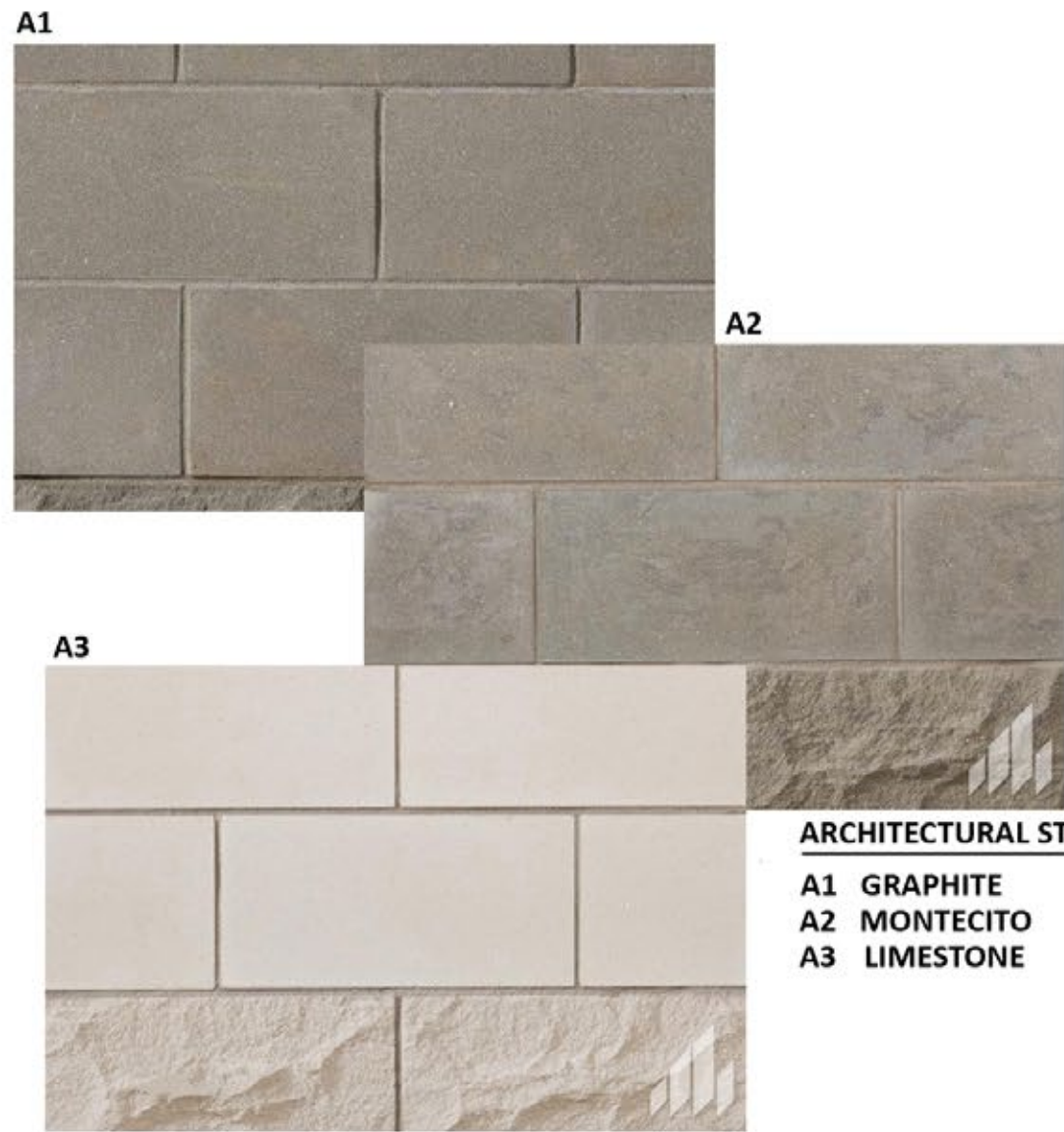
ARCHITECTURAL STONE: A1 GRAPHITE A2 MONTECITO A3 LIMESTONE