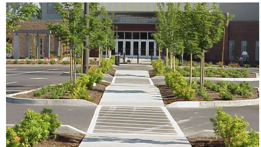
Shade and visual interest with safe pedestrian connections