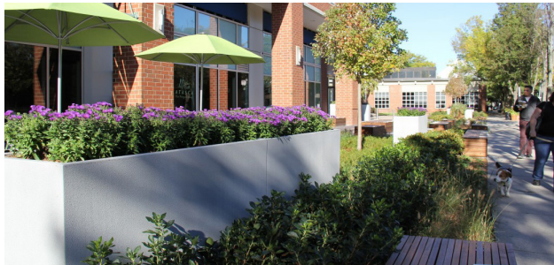
Raised planter integrated into the planting beds