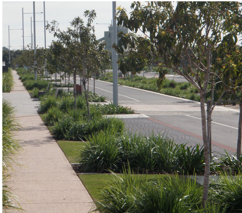
On-street parallel parking screened while providing breaks for pedestrian through-access.

Landscape buffers and screening shall provide seasonal interest, deciduous and evergreen plants of varying height plants can be layered in linear forms.