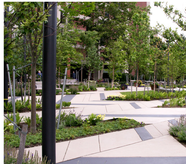
Plaza areas with integration of native landscape