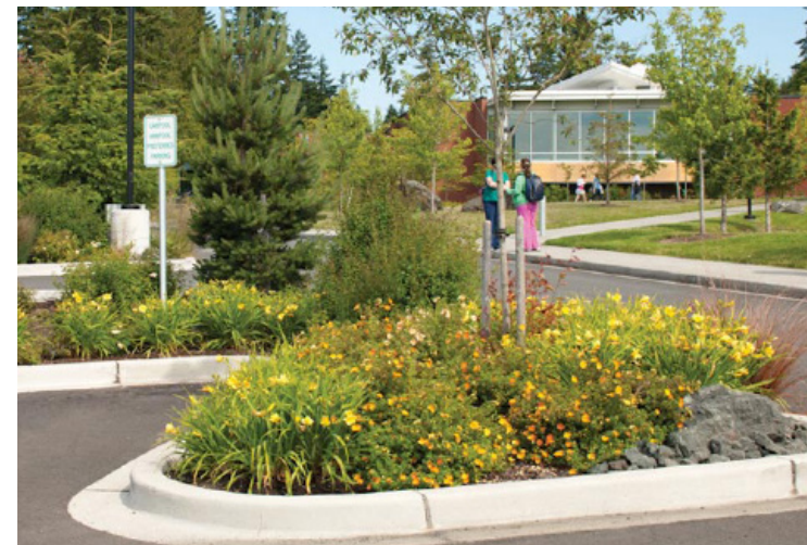
Parking screened with plant material