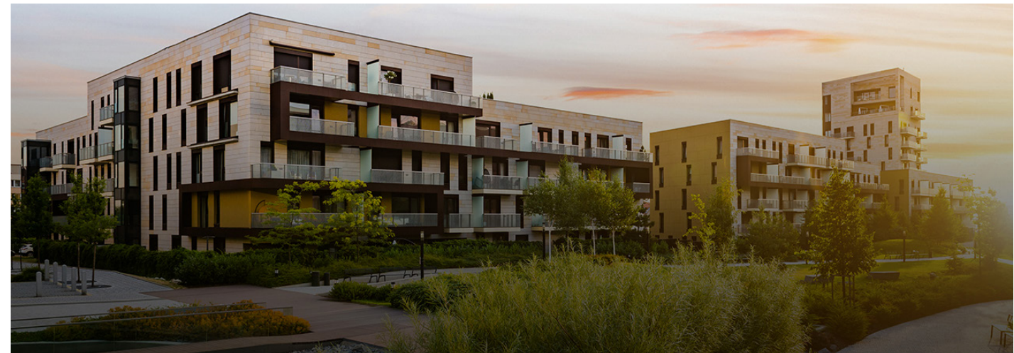
Creating seating nodes within large areas