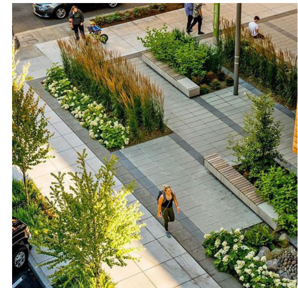
Functional and attractive transition spaces.