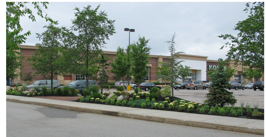
Parking screened with visual interest and layering of plants