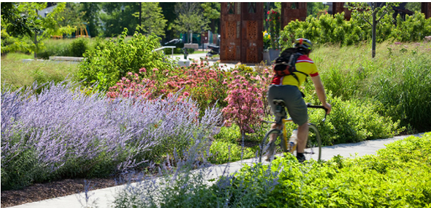
Native landscape with contrasting pops of color