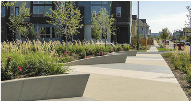
Seating elements with ornamental grasses and perennials

Accent elements shall be used to bring the user closer to nature and can include planters, movable pots, raised planting beds, tiered retaining walls, etc. Plants in these elements will be carefully selected to provide interest year-round and be safe for close contact with users of all ages. These elements also give the opportunity to establish place-making connections between plant fragrance and use. Plantings around retaining walls will not interfere with the integrity of the wall.