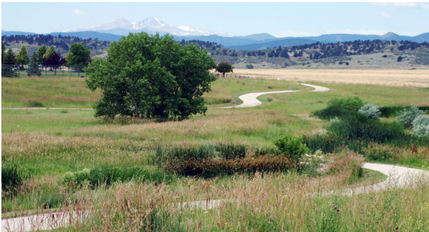
Native planting to tie into adjacent uses