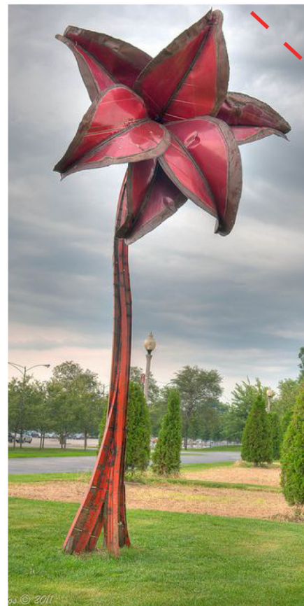
COTTONWOOD CREEK – PH1 PUBLIC ART LOCATION EXHIBIT