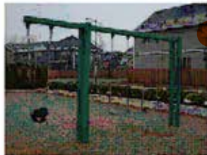
New Swing Set