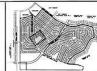
VICINITY MAP SCALE: 1"=1000'