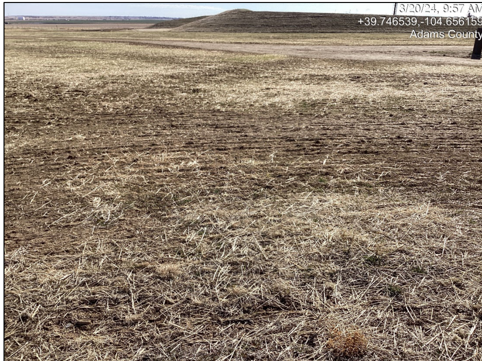
1. Facing southeast from northwestern terminus of easement.