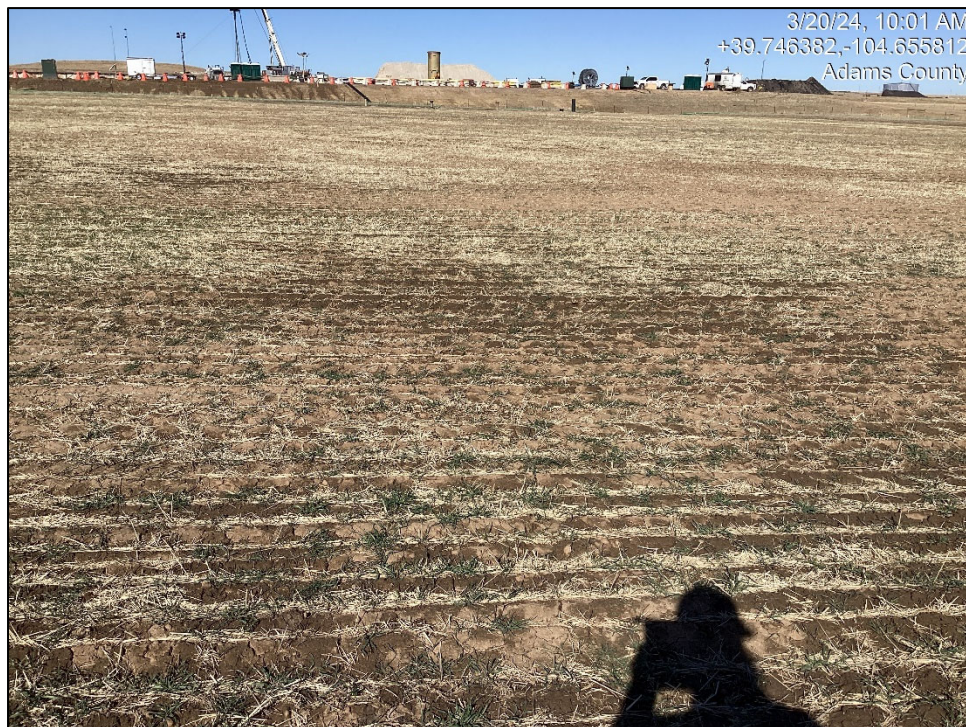
2. Facing northwest from center of easement.