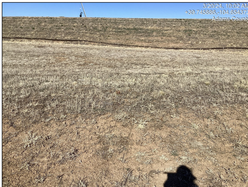
4. Facing northwest from southeastern terminus of easement.