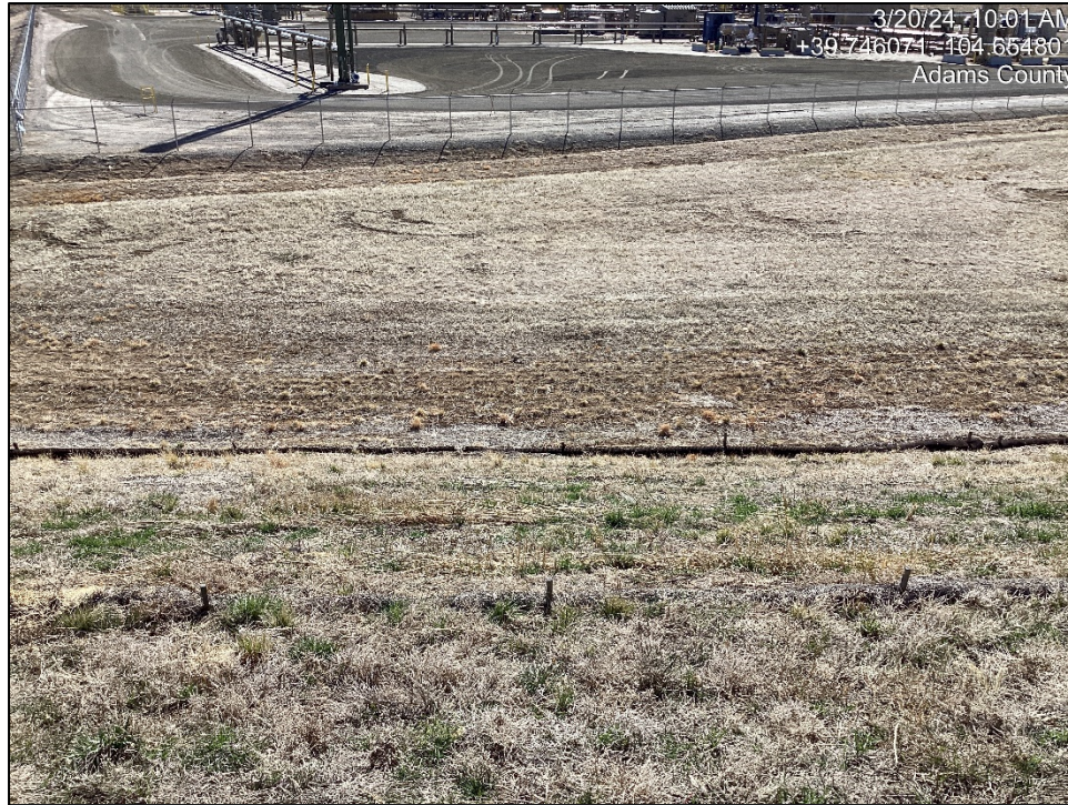
3. Facing southeast from center of easement.